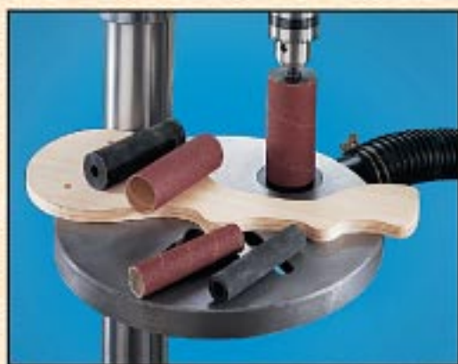
W1667 & W1668 patented spindle oscillation for sanding

SHOP FOX® offers a broad assortment of drill presses to suit every need - from small hobby shops up to professional machine shops. Our unique oscillating models afford two machine convenience in half the space and our radial drill presses offer unmatched versatility. For the best selection of features, performance and value, look no further than SHOP FOX®.