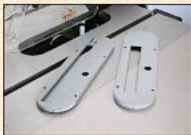
Includes Both Standard & Dado Inserts

Available in right or left tilt, both models have solid cast iron extension wings and plenty of power to spare.