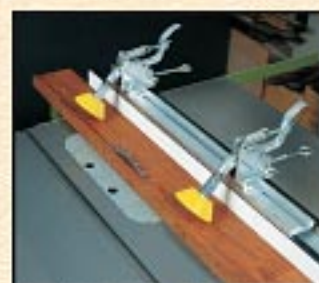
W1104 Board Buddies® Anti-Kickback Hold Downs for Table Saws