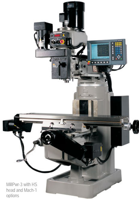
MillPwr-3 with HS head and Mach-1 options

CNC Knee Mill: KTM-3VKF-MillPwr-2axis KTM-3VKF-MillPwr-3axis