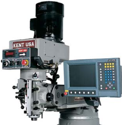
KTM-3VKF with MillPwr-2

Position-Trac scale has absolute encoder technology. This allows MillPwr control to find machine "home" position in any axis by moving only up to 2" of travel. Once homed, work piece datum is established and the control can repeat a position even after being powered off. As an added benefit, software limits can be set to safely keep machine travel within machine travel limits without the need of additional hardware limit switches and home switches.