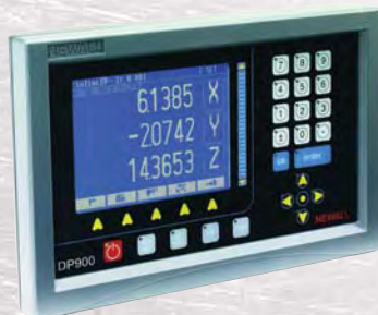
Newall DP900 - DRO