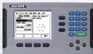
Acu-Rite 200S - DRO