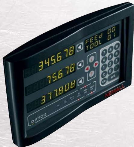
Newall DP700 - DRO